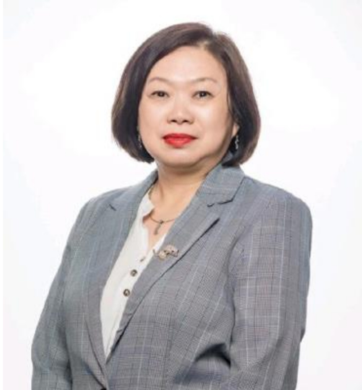
Certified ACTA Trainer VC –Accelerator/Mentor